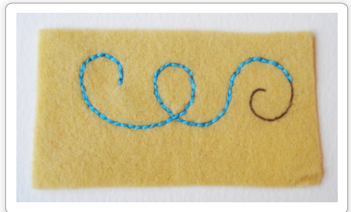
The transferred image is covered nicely with embroidery floss